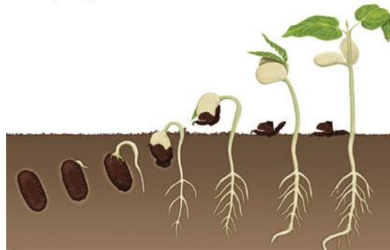
How a plant grows from a seed

We will be focussing on plants using our key book, 'Jasper's Beanstalk'. The children will be busy carrying out lots of activities to do with planting: planting cress seeds, preparing beans to sprout and looking at the stage of planting and growth.